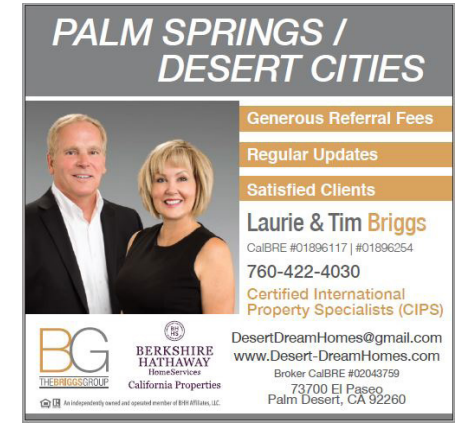
Ad Shown is Actual Size